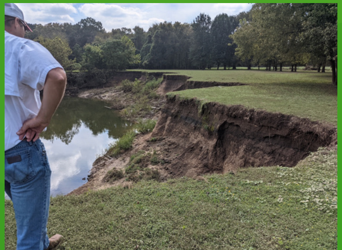
Stormwater runoff causing severe bank erosion in Hoover

Read more about our accomplishments at cahabariversociety.org/2023-impact .