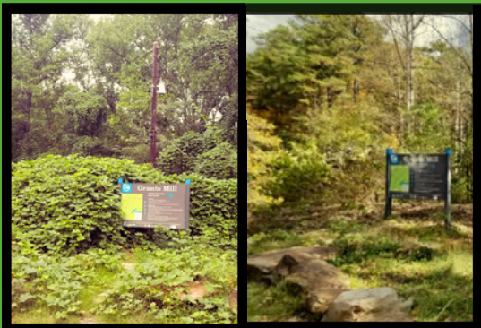
Irondale Riverwalk, before & after kudzu removal.

35 partner organizations 587 volunteers 12,208 lbs of trash removed by hand 300 lbs of cans and bottles recycled 3,814 lbs of tires removed 3,400 lbs of invasive species removed