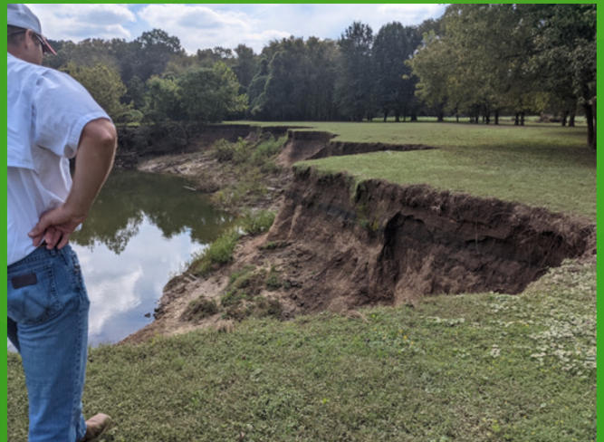
Stormwater runoff causing severe bank erosion in Hoover

Read more about our accomplishments at cahabariversociety.org/2023-impact .