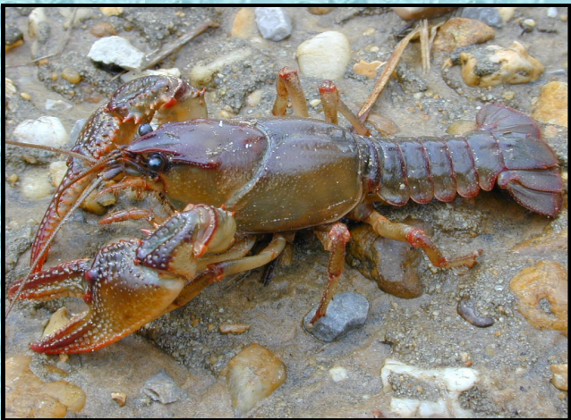
Crayfish, Crawfish, Crawdad, Mudbug