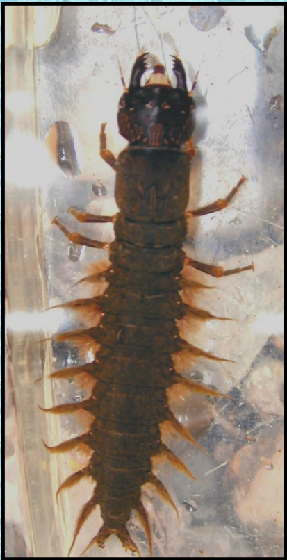
Dobsonfly larva or “Hellgrammite”