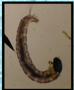
Midge Fly larva