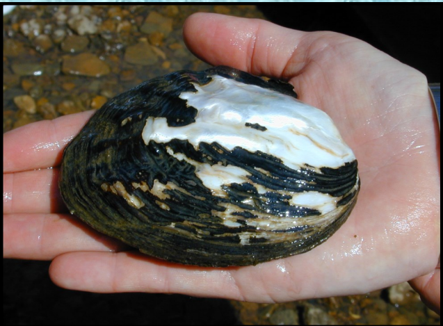
Native Freshwater Mussel