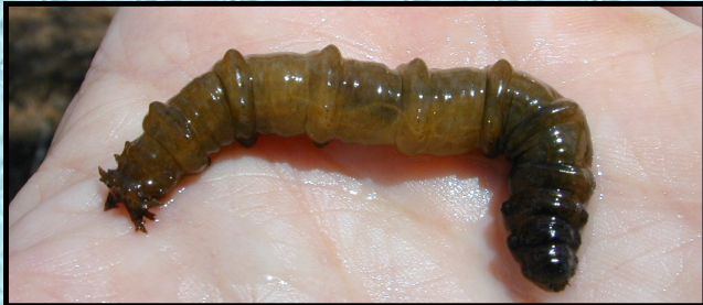
Crane Fly larva