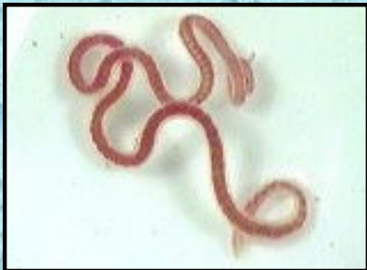
Aquatic Oligochaeta Or Aquatic Earthworm